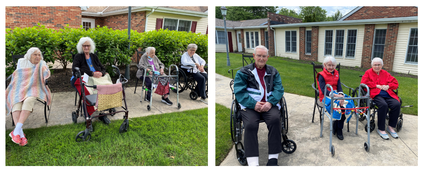
Was a little cool this particular afternoon! Jackets and blankets needed!

Every Friday, residents enjoy musical entertainment, and weather permitting, we enjoy the music outdoors in the Grande Courtyard. So far, we've been lucky to be outdoors.