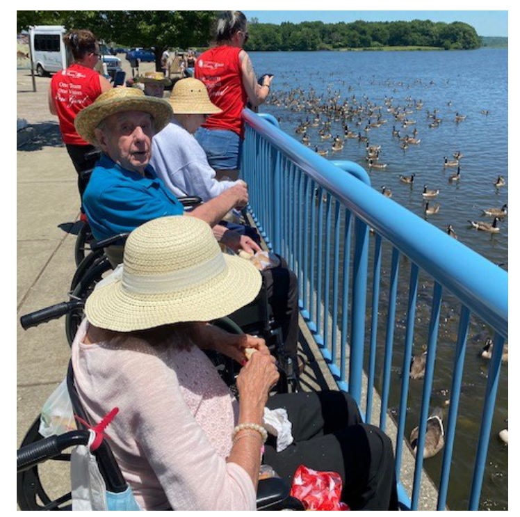
Feeding the ducks and the fish