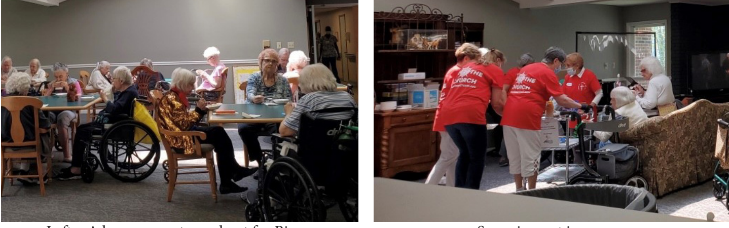
Left - A large group turned out for Bingo