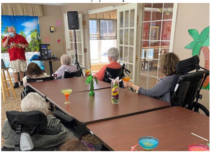
Listening to beachy music