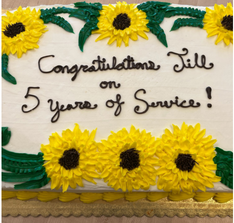
What a pretty cake!