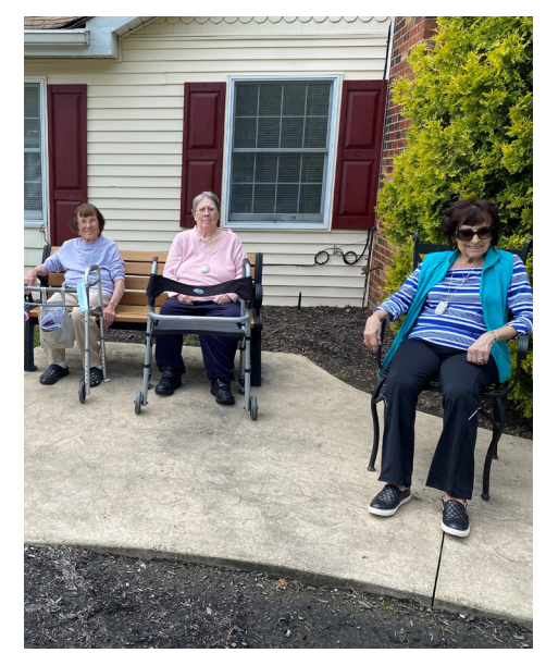
Getting ready to enjoy the concert!