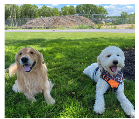
Wind and Bowie! Too cute!