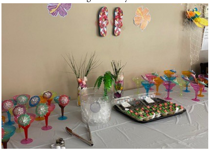
All ready to enjoy!