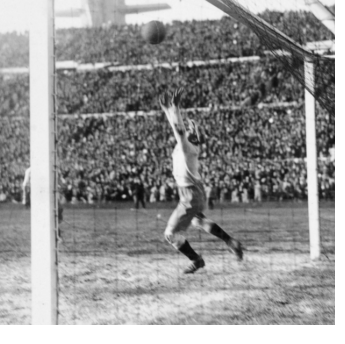
JULY 27, 1953 The Korean War ends

The first soccer World Cup begins in Uruguay (** which country won the title?)