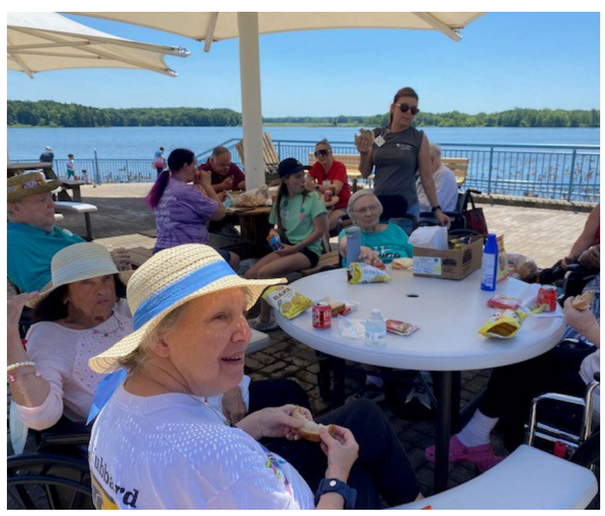
The group enjoys a picnic lunch