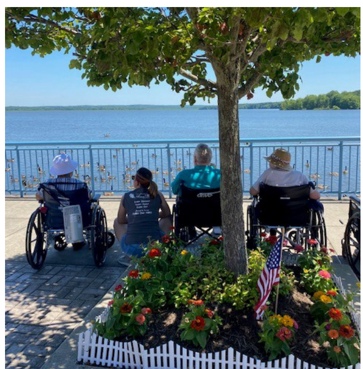
What a beautiful day!