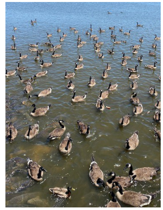
Ducks and fish

Pymatuning State Park is a popular vacation destination on the Ohio-Pennsylvania border, wellknown for its superb outdoor activities. One of the largest warm water fish hatcheries in the world can be found north of the causeway including the famous Linesville "spillway." Fun can be had feeding the carp; some days, the carp is so plentiful the ducks walk across their backs (or so says the legend). Kensington residents enjoyed a wonderful afternoon feeding the carp and the ducks. Weather cooperated nicely, with cool breezes coming off the lake.