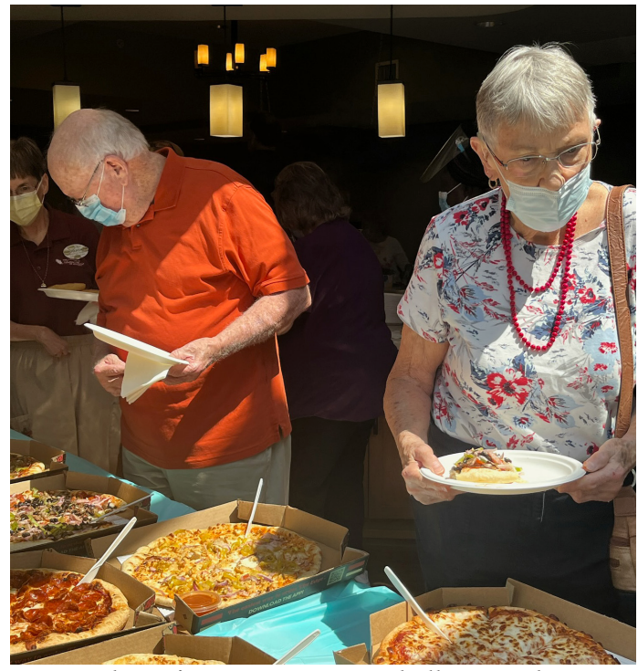
Sharon's parents were cordially invited