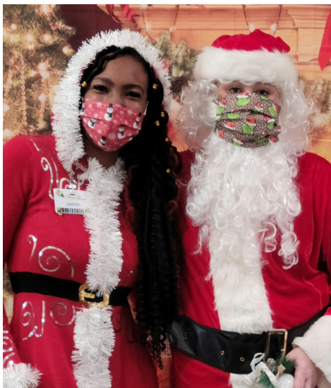
Ho, Ho, Ho