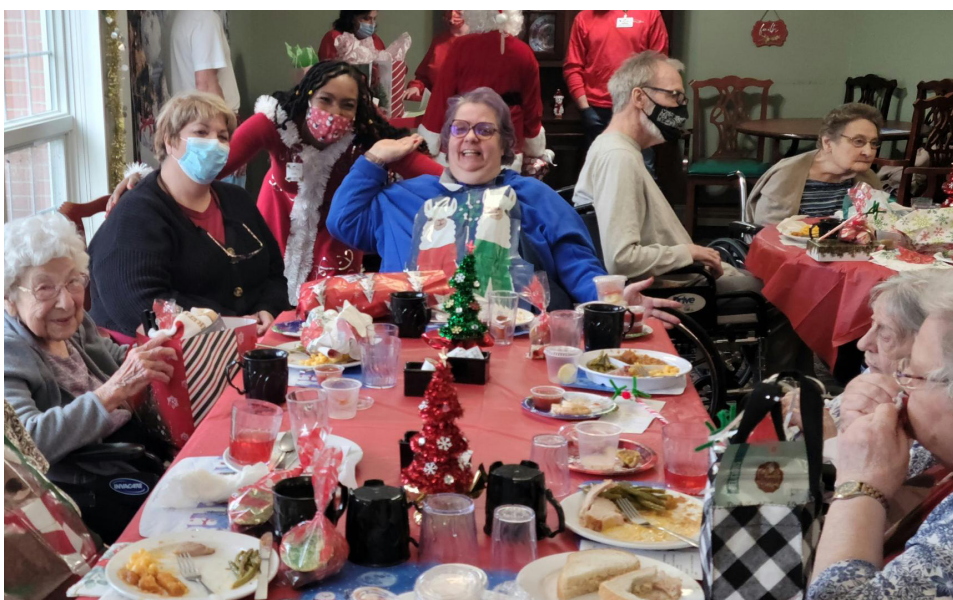
Let's get ready to EAT! What a feast!