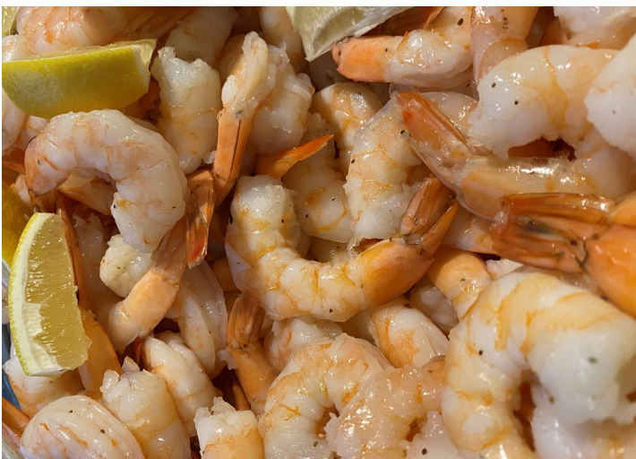
Residents enjoyed lots and lots of shrimp