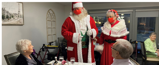
Mr. and Mrs. Claus making rounds