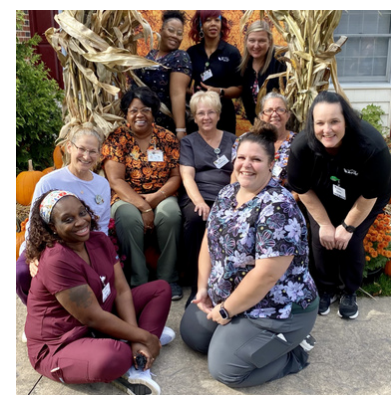
AL & IL Staff