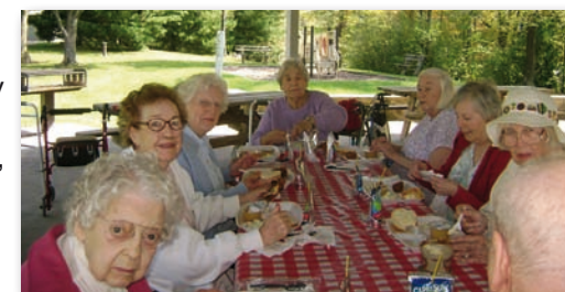
Residents enjoying lunch